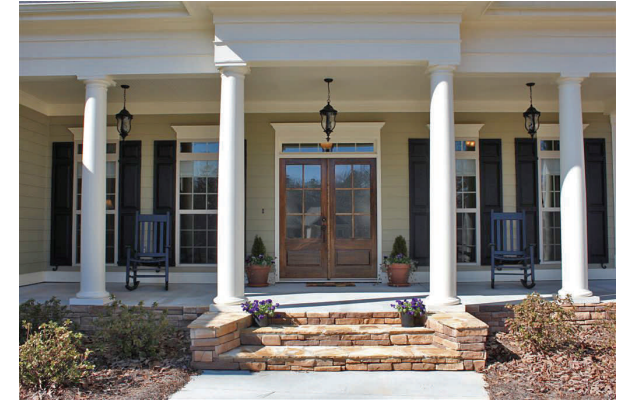
Elegance in Beaumont Farms