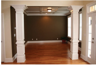
Formal Living Rm.