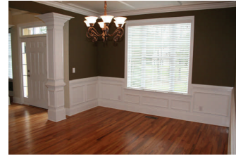
Formal Dining Rm.