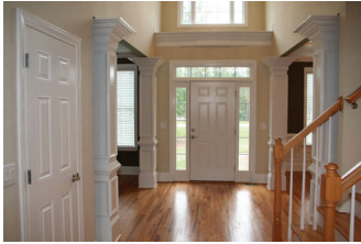
2 Story Foyer