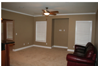
Terrace Media Rm