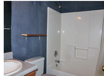
Lower Level Full Bath