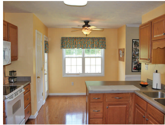
Kitchen & Breakfast