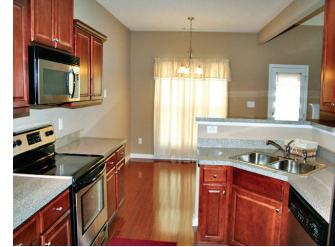
2nd View Kitchen