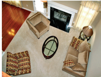
2nd Floor View