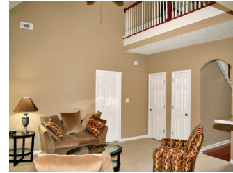
Great Room 2