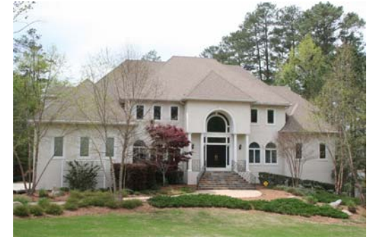
Elegant Waterfront Living