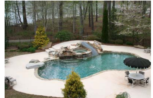
260 Smokerise Trace Peachtree City, Georgia 30269