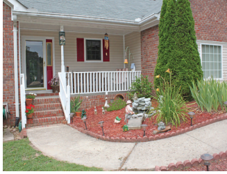
Rocking Chair Porch